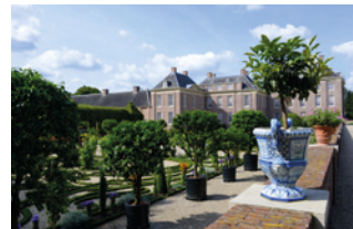
→ Loo Palace