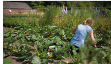
→ Kitchen Garden Vollenhoven

Wednesday evening, September 4 a meet and greet for early arriving participants (with drinks and small bites), including a guided tour through the historic kitchen garden of Vollenhoven country house in Bilthoven.