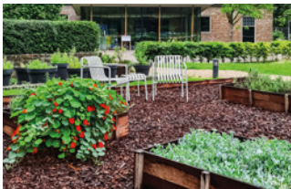
→ Parc Broekhuizen

An evening dinner is part of the program and is an excellent chance to network and to share experiences and knowledge with other participants.