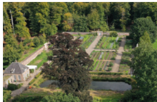
→ Historic Kitchen Garden Zuylestein