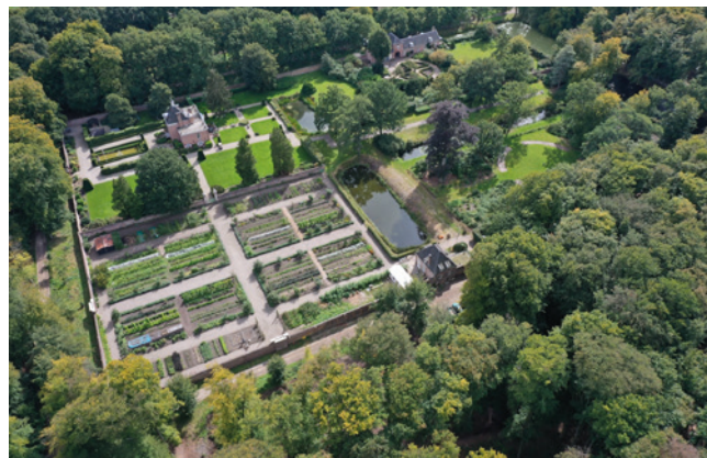
Kitchen garden at Culinary Estate Parc Broekhuizen | Aerial view of the kitchen garden of Zuylestein

You are kindly invited to join us at the second in person meeting of the European Symposium on the conservation of historic fruit and kitchen gardens on Thursday, September 5, 2024 at Culinary Estate Parc Broekhuizen in Leersum, The Netherlands. This is a centrally located country house in the province of Utrecht.