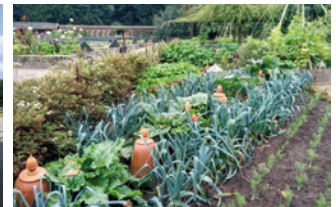
→ Twickel Estate